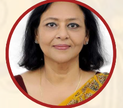
Neelkamal Darbari (IAS)