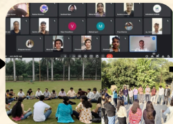
10+ Online and Offline Meetups and Discussion