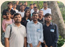
RLA 1st Meeting