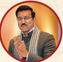
Rajyavardhan Singh Rathore (politician)