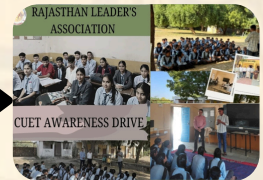
Start Cuet Admission Helpdesk