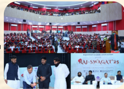
'Raj-Swagat' Mojar Cultural Event of RLA