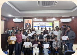
Organized 'Samarth' In Kirorimal college