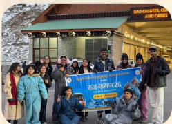
'Raj-Bhrman' Himachal Trip